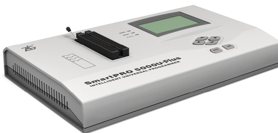
Picture 1-1 Product Picture

SmartPRO is a series of universal programmer, Within the series, SmartPRO 5000U-PLUS and SmartPRO T9000-PLUS both support the programming to PCF7952 chip; also they can be upgraded to support all similar chips. This document provides a brief description on how to use SmartPRO series programmer to program PCF7952; also provides a small performance comparison and lists out some customers feedbacks to illustrate the advantages of SmartPRO programmers on programming PCF7952.